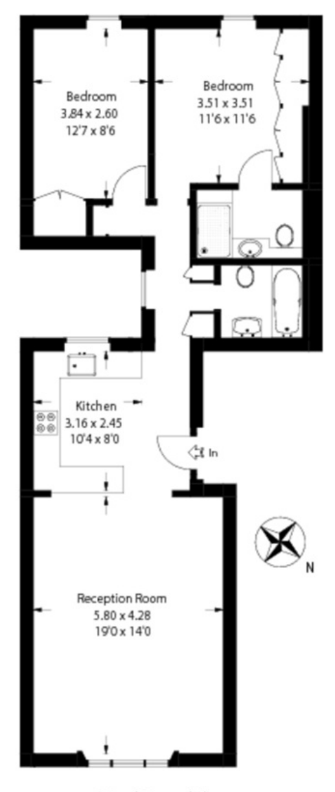
Raised Ground Floor

Approximate Gross Internal Area: - 75 sq m / 807 sq ft